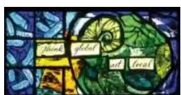
Learning from the Lasses Women of the Patrick Geddes Circle