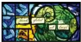
Learning from the Lasses Women of the Patrick Geddes Circle

The lasses teach us that embracing our true selves is the key to living a fulfilling life. They show us that being confident in who we are, with all our flaws and strengths, allows us to navigate through challenges with grace. Just like these fearless women, we need to embrace our authenticity and let our unique qualities shine.