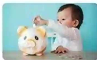
Копилка (Piggy Bank)