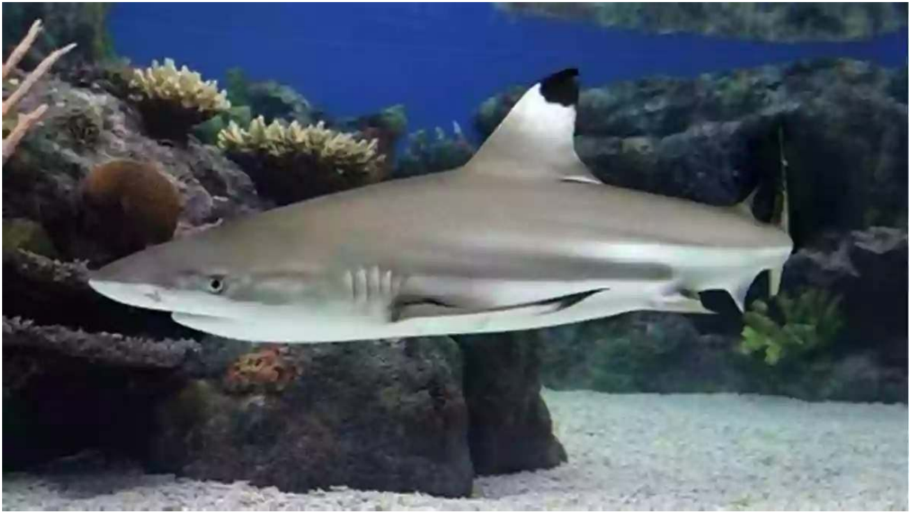
The Vibrant Coral Reefs