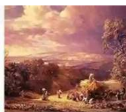
The Song of the Earth — JONATHAN BATE

But where does this enchanting melody come from? Is it a literal song or a metaphorical representation of our interconnectedness? Join us on a journey as we explore the origins, significance, and power of the Song Of The Earth.