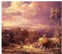
The Song of the Earth — JONATHAN BATE

As the ancient wisdom reminds us, the Song Of The Earth is a melody that connects us all. It is a call to rediscover our deep-rooted connection to nature and to cherish and protect the planet that sustains us. So pause, breathe, and tune in to the captivating melody that sings through the Earth – the Song Of The Earth.