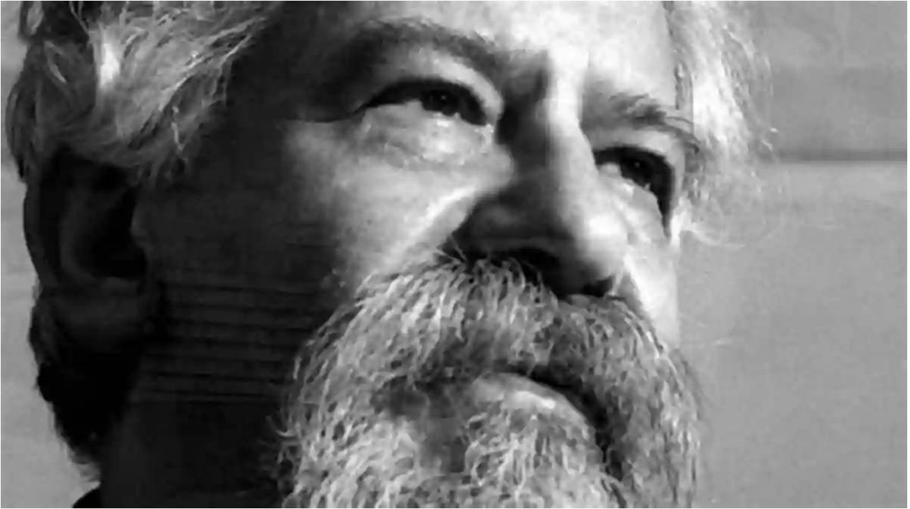
Portrait of Abraham Joshua Heschel

As we delve deeper into Heschel's teachings, we discover that the call of transcendence is not limited to any particular religious tradition. It transcends boundaries, embracing the seeker of truth in every corner of the world. Heschel's writings and teachings serve as an invitation to embark on a spiritual journey, to explore the depths of our own souls, and to connect with the divine presence that permeates all of creation.