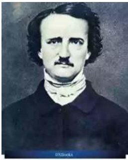
Complete Tales and Poems EDGAR ALLAN POE