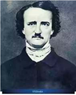
Complete Tales and Poems