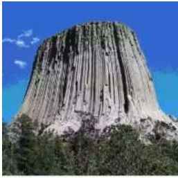
Geology of Devils Tower National Monument Wyoming