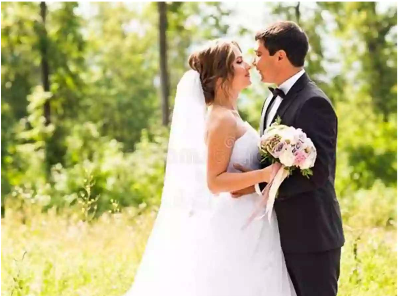
Image: French lovers enjoying a romantic moment

One key aspect of French love is maintaining a sense of mystery. French men and women often leave a little something to the imagination, allowing their partners to discover new depths over time. This element of intrigue keeps the flame of passion burning and nurtures a lifelong connection.