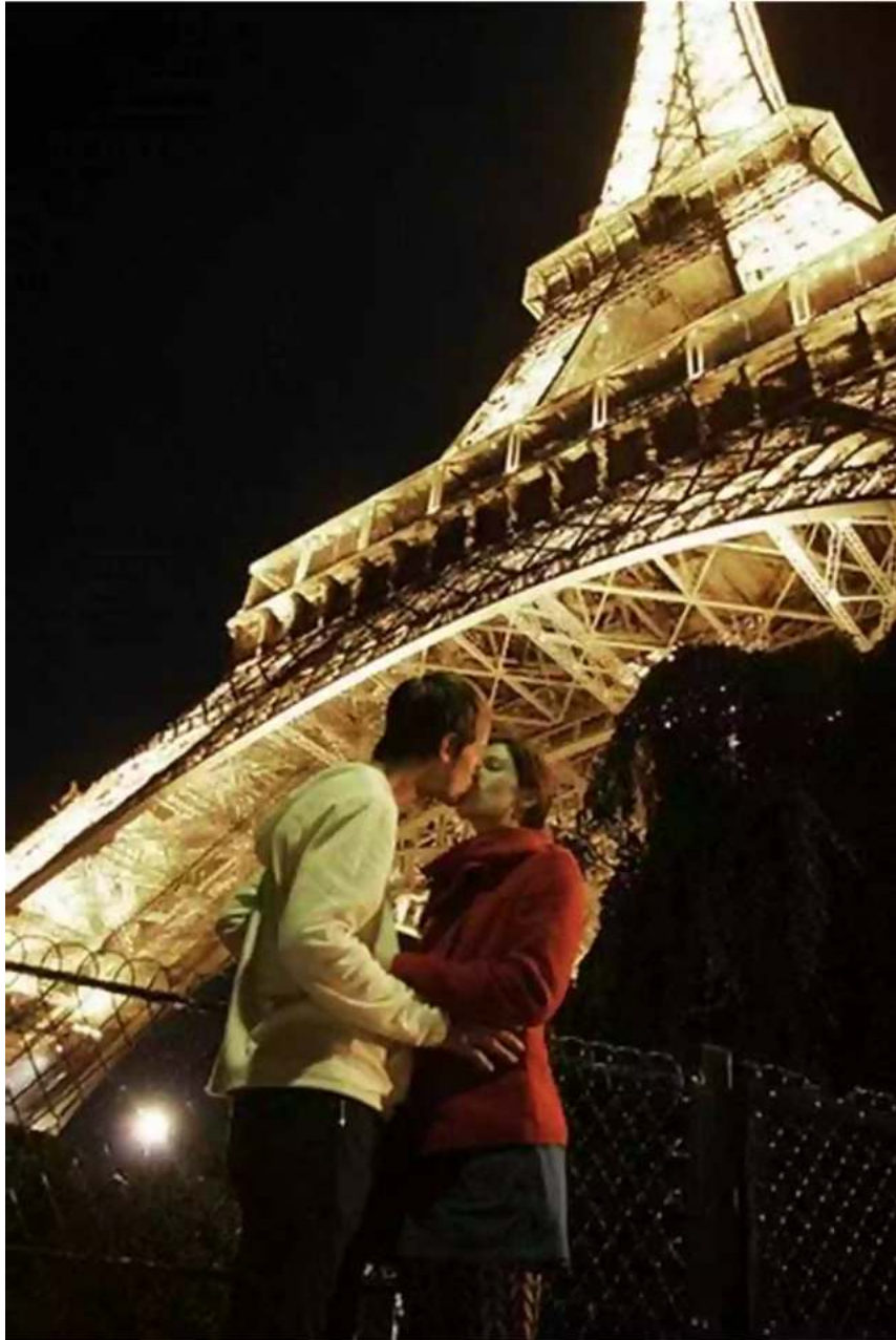
Image: A couple sharing a kiss under the Eiffel Tower

scents, soft lighting, and delicate textures to enhance the romantic atmosphere.