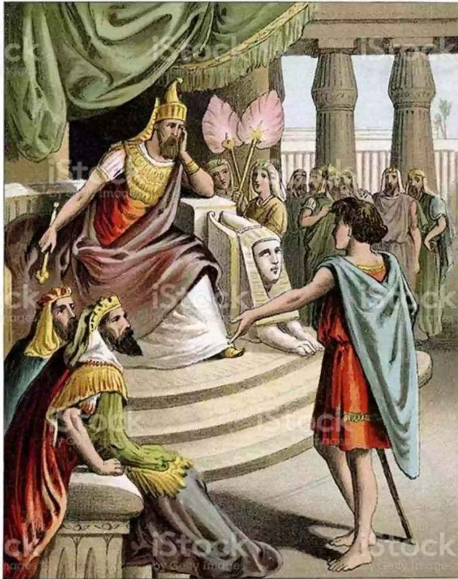
JOSEPH INTERPRETING PHARAOH'S DREAM

Long ago, in the land of Canaan, there lived a young man named Joseph. His extraordinary story of dreams, betrayal, and redemption has captivated generations, making it one of the most fascinating accounts in the history of