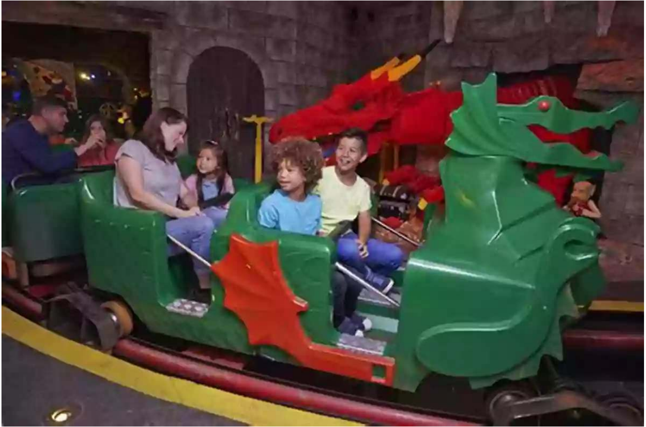
The Enchanted Forests: Discovering Sherwood and the New Forest