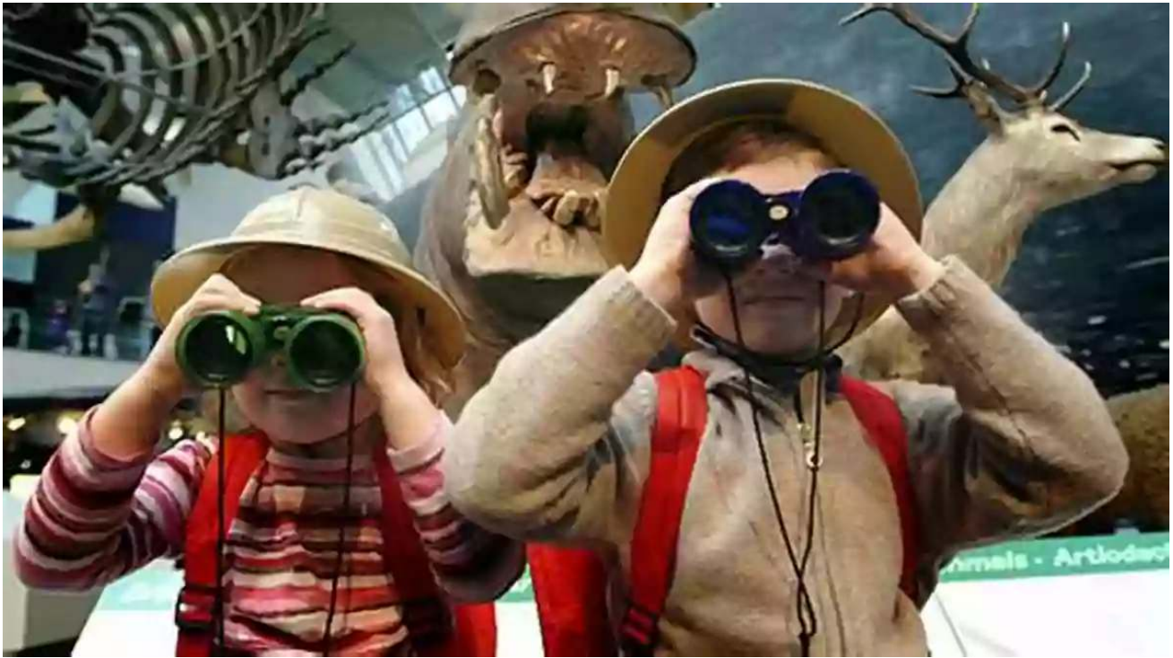
The Magical World of Alice in Wonderland: Visit Oxford