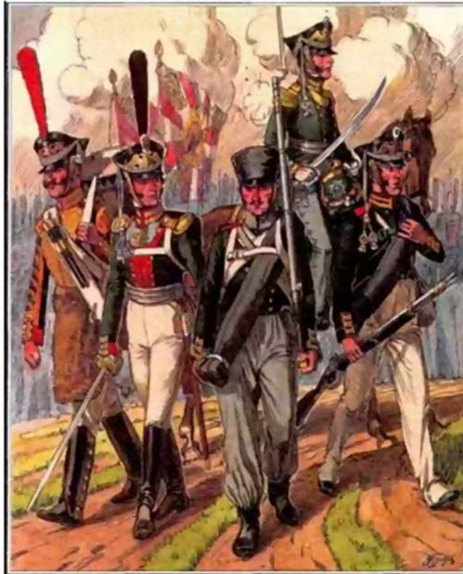
Гвардейская пехота, 1812—1813 гг. Ротный барабанщик, обер-офицер и ротный из полка Лейб-Гвардии Литовского полка, штаб-офицер Лейб-Гвардии Финляндского полка, ротный Лейб-Гвардии Егерского полка